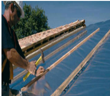
TRI-ISO SUPER 10 Installed prior to fitting roof tiles

This product has been tested under real conditions by TRADA Technology Limited and certified by BM TRADA Certification Limited - (Certificate n°0102, issued on April 3, 2006) as being the equivalent to 210 mm of mineral wool. However, we strongly recommend that users check with their local Building Control regarding Part L Building Regulations issued on April 6, 2006, before purchasing this product.